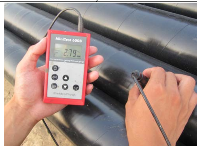
Coating layer thickness check