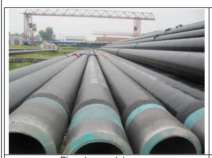
Pipe storage status