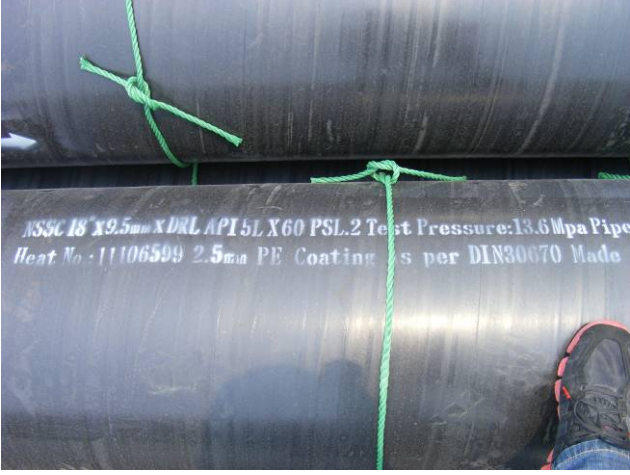
Marking on body check