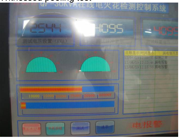
Witnessed holiday test