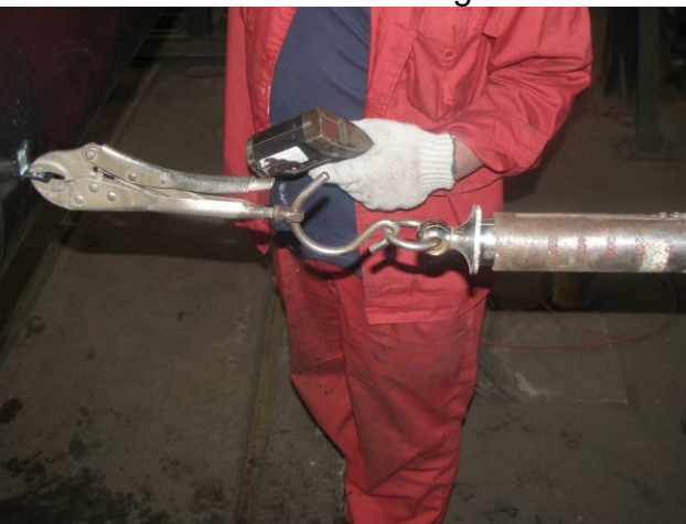
Witnessed peeling test