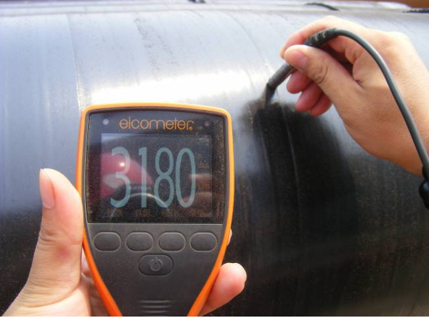
Total thickness of 3PE coating check