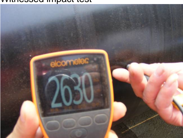
Total thickness of 3PE coating check