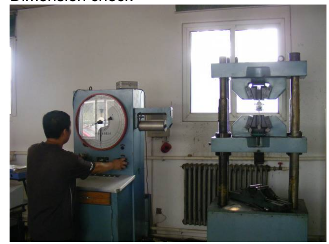
Witnessed tensile test