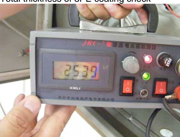
Witnessed holiday test