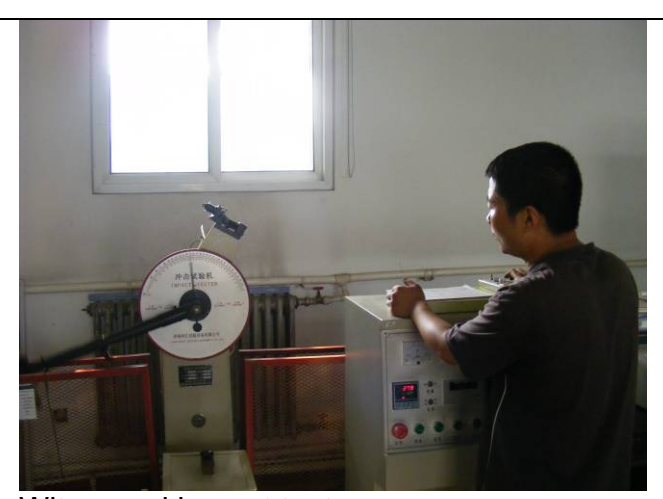
Witnessed impact test