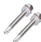
Self Tapping Screw